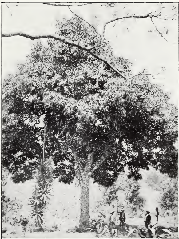
Tree from Which "Linda" Buds Were Taken in Guatemala.